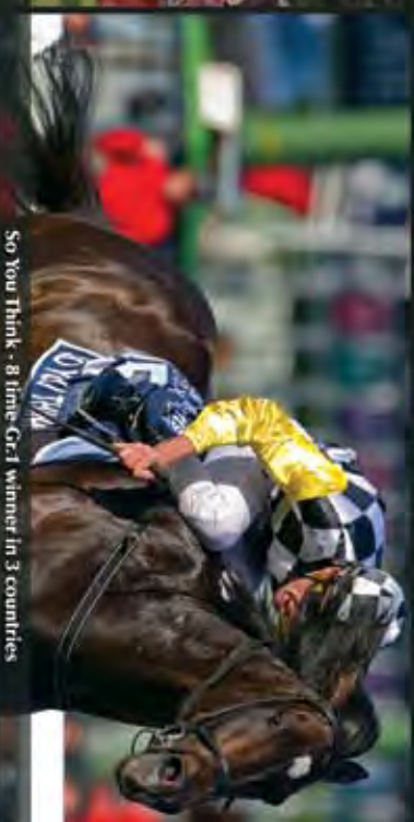
So You Think - 8 Time Gr.1 Winner in 3 countries