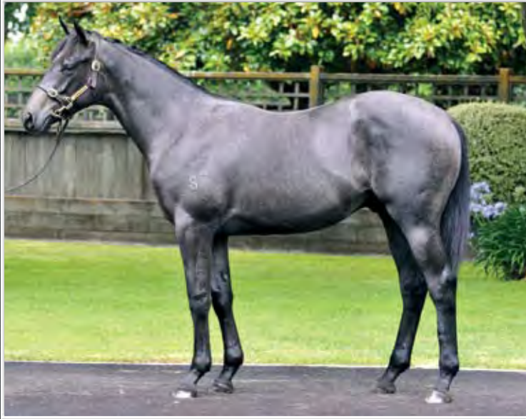
LOT 181 GREY COLT GUILLOTINE – ENDLESS JOY

NEW ZEALAND THOROUGHBRED RACEHORSE OWNERS FEDERATION