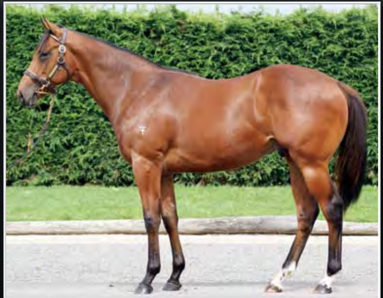
LOT 432 BAY COLT THORN PARK – SHARVASTI