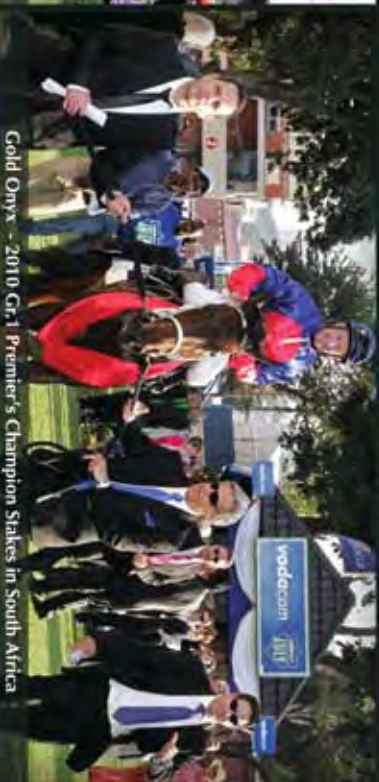
Gold Onyx - 2010 Gr.1 Premier's Champion Stakes in South Africa