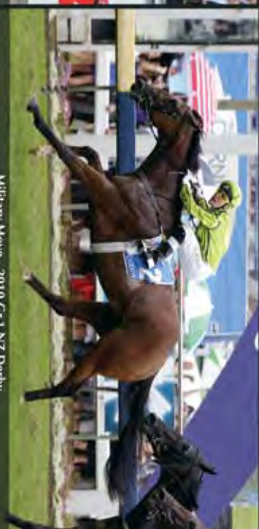
Military Move - 2010 Gr.1 NZ Derby