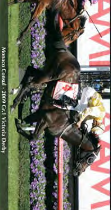
Monaco Consul - 2009 Gr.1 Victoria Derby