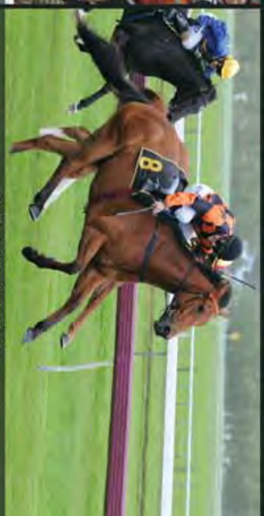
Distill - 2011 Gr.1 Lewin Classic