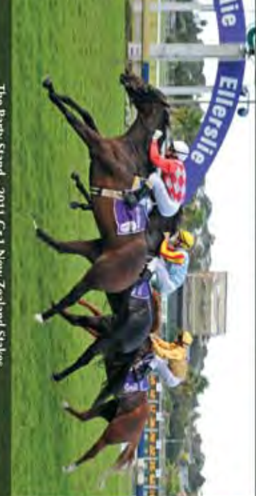
The Party Stand - 2011 Gr.1 New Zealand Stakes