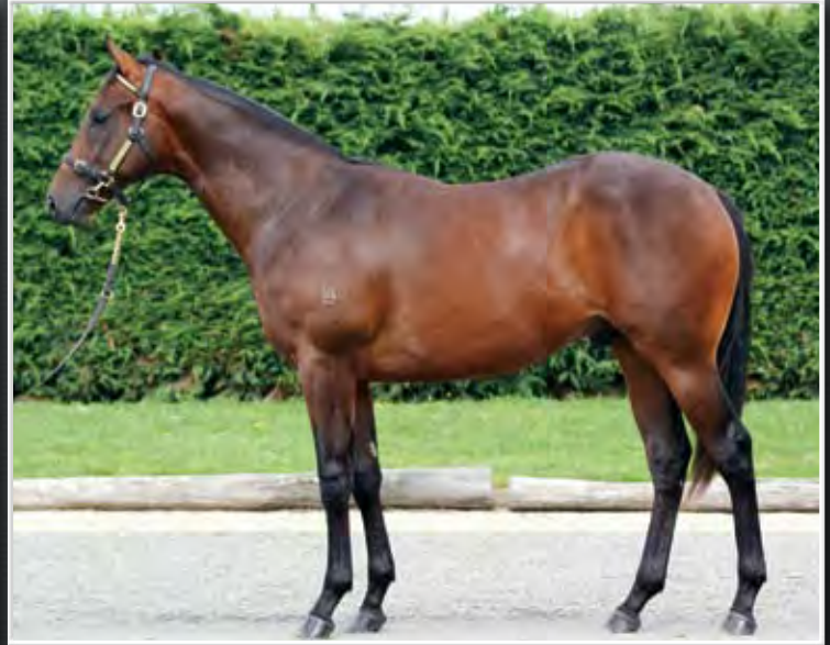
LOT 392 BROWN COLT DARCI BRAHMA – RAPID KAY