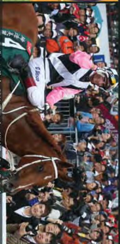
Beauty Flash - 2011 Champion HK Miller & 4 x Gr.1 Winner