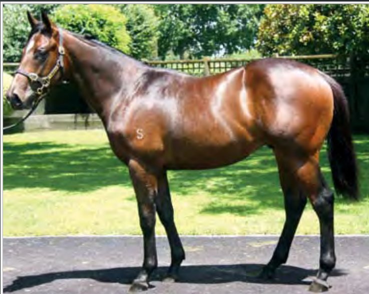
LOT 122 BROWN COLT THORN PARK – CLOWN PRINCESS THORN PARK PEDIGREE