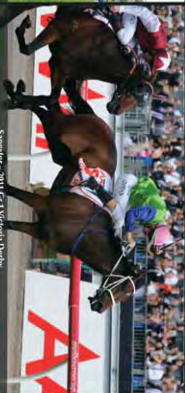
Sangster - 2011 Gr.1 Victoria Derby