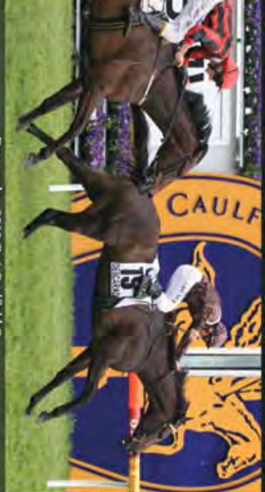
Descrado - 2010 Gr.1 Caulfield Cup