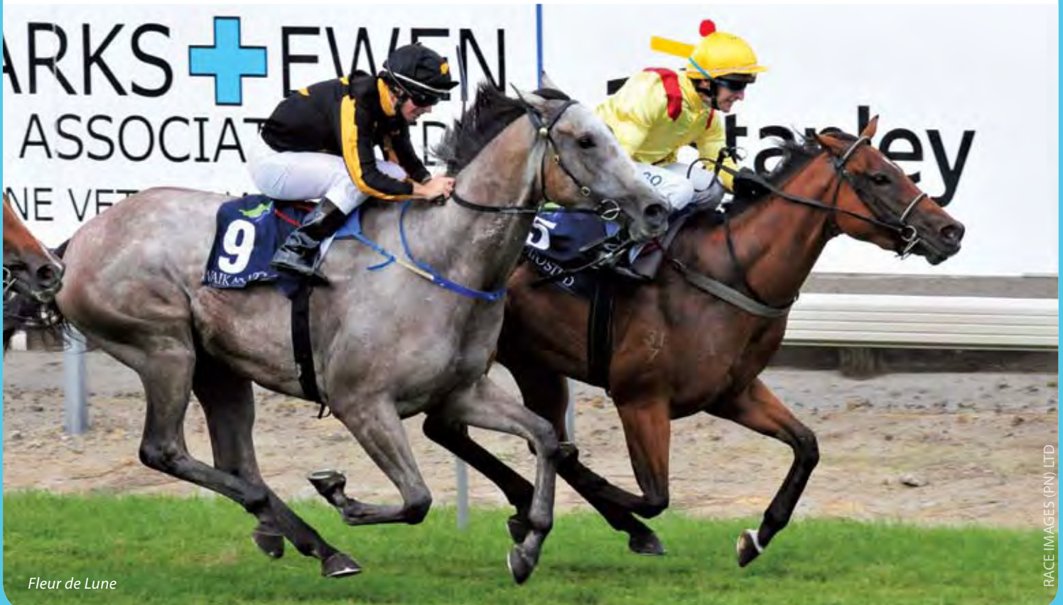
Fleur de Lune