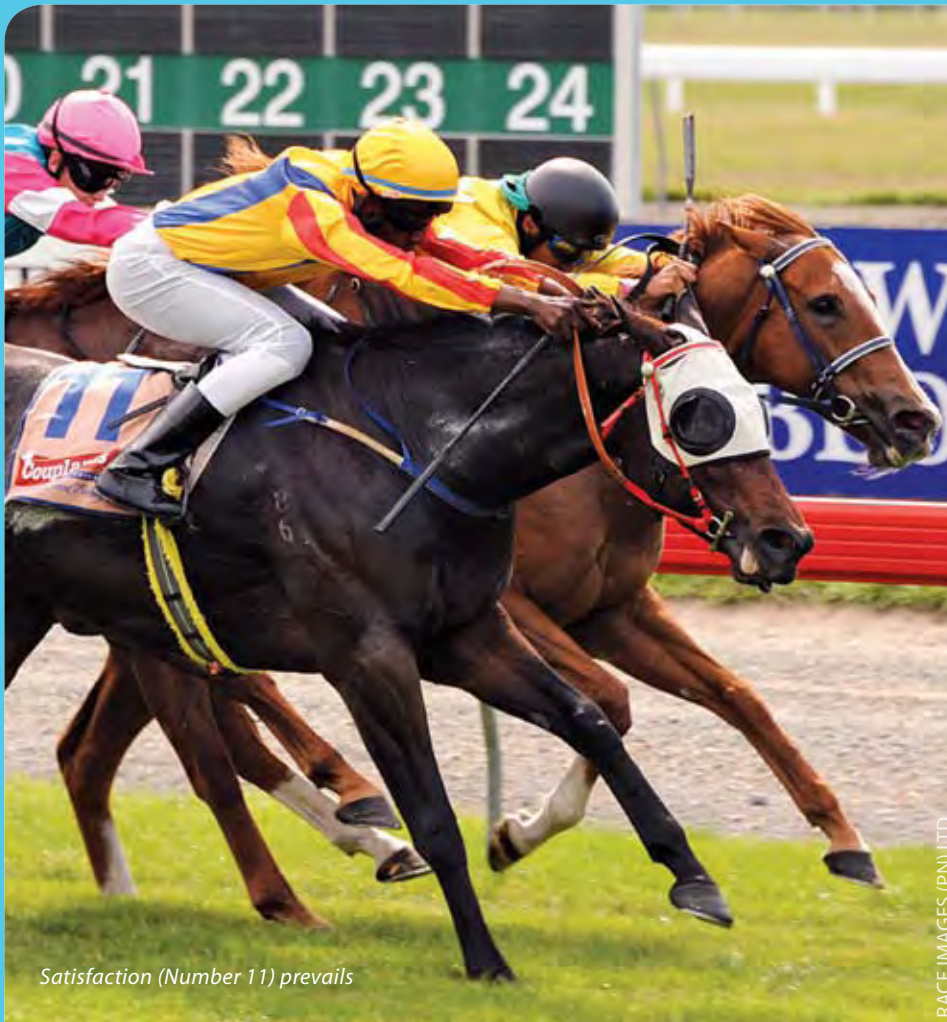
Satisfaction (Number 11) prevails