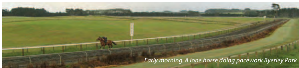
Early morning. A lone horse doing pacework Byerley Park

Trainers Licenses for men only and to qualify they must have worked 4 years in a stable or served a Jockeys Apprenticeship.