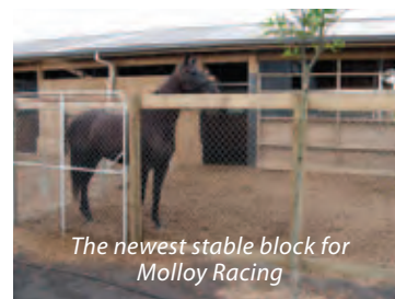
The newest stable block for Molloy Racing