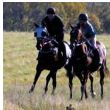
Satisfaction and 2 yr old My Halo-Exploza gelding working at Kingsdown Stables