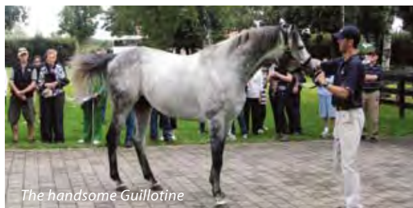
The handsome Guillotine