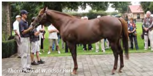
Thorn Park at Windsor Park