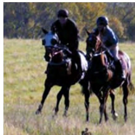
Satisfaction and 2 yr old My Halo-Exploza gelding working at Kingsdown Stables