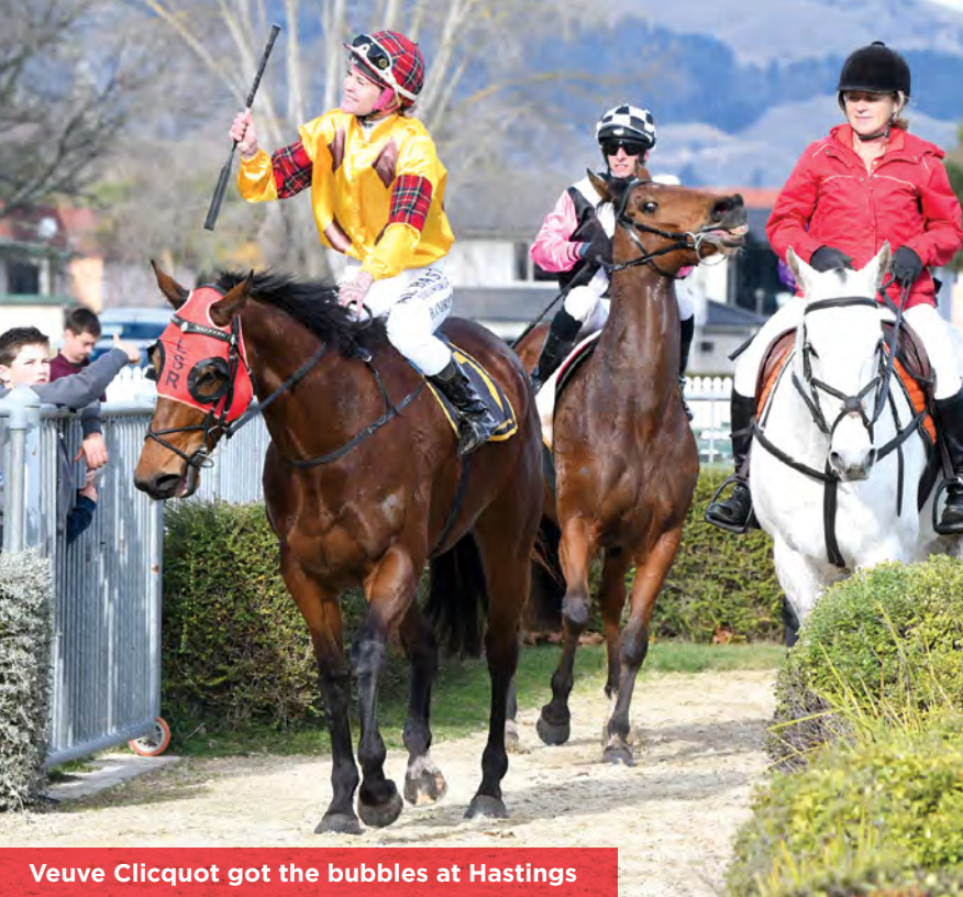
Veuve Clicquot got the bubbles at Hastings