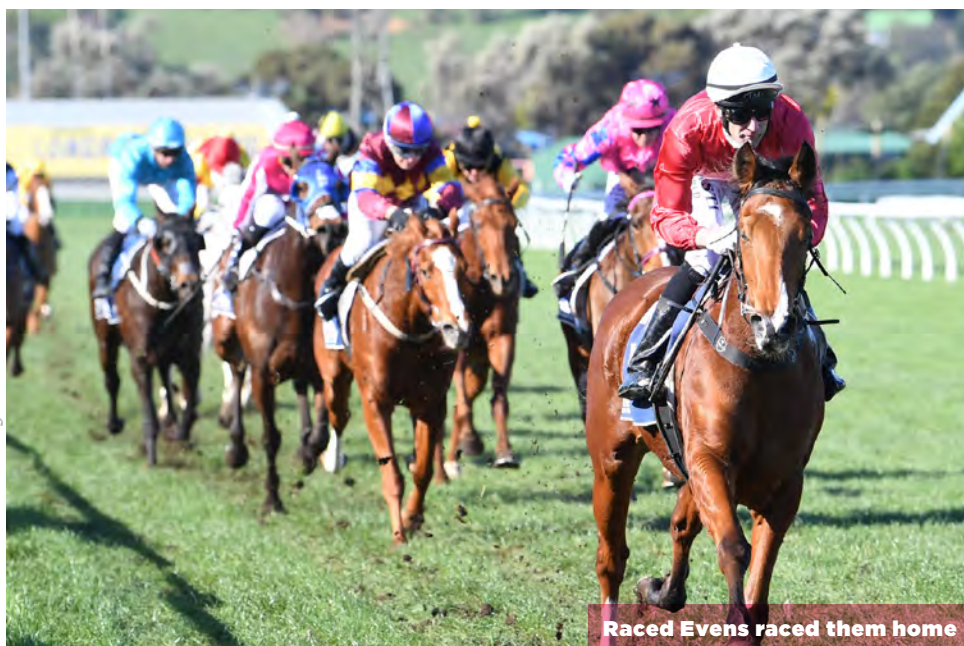
Raced Evens raced them home