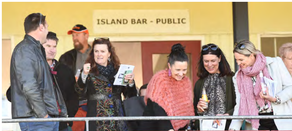
Raced Evens excited owners at Wanganui

The Wanganui-Taranaki Racehorse Owners AGM will be held at Wanganui on Tuesday 29th September.