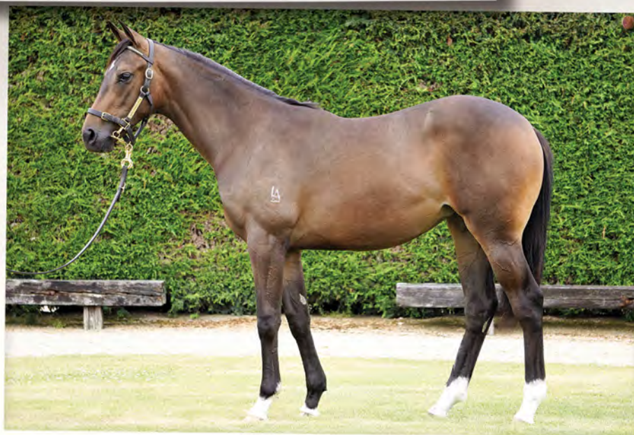
TIME TEST - ELOA - LOT 370