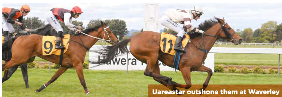
Uareastar outshone them at Waverley