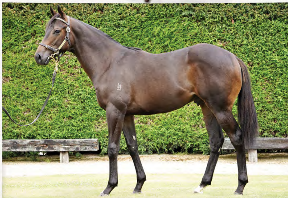
TIME TEST - ROYAL EXCESS - LOT 83