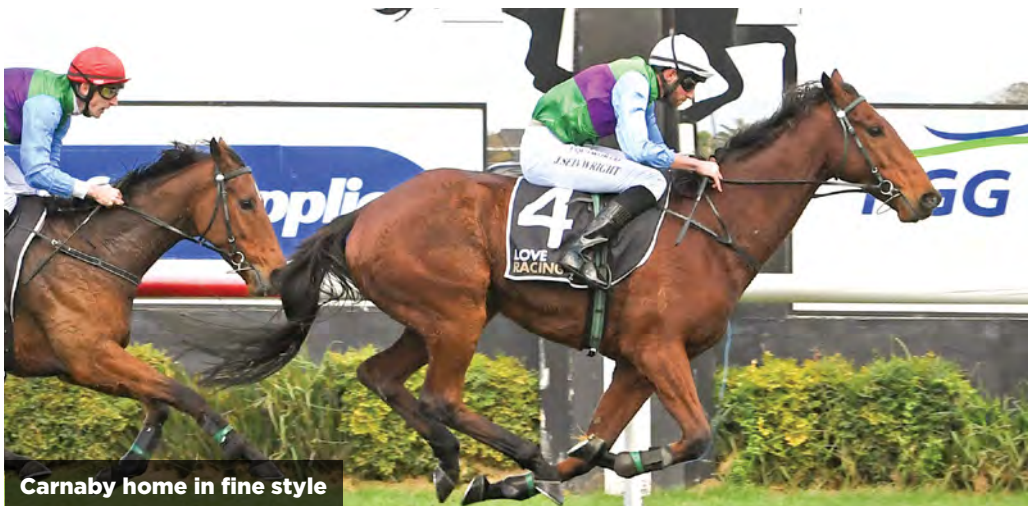
Carnaby home in fine style

Best wishes with your future racing from Waikato/Bay Of Plenty Racehorse Owners Association