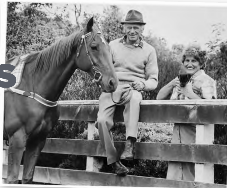
Snowy, Anne, Kiwi & Spot at Lakeside, 21 March 1987.

Snow, Anne and Kiwi are all sadly gone, but when the Melbourne Cup rolls around each