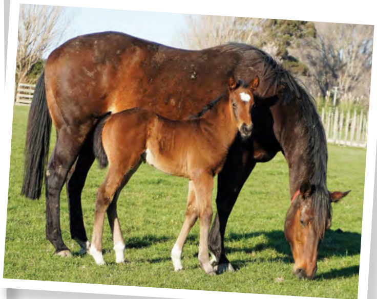
above: Time Test x Angel Van Harlem left: Per Incanto x Winehouse