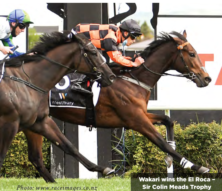
Wakari wins the El Roca – Sir Colin Meads Trophy