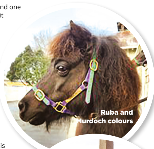
Ruba and Murdoch colours

Interestingly Jakkie Good has been instrumental in both of these ponies' rubbing shoulders with racehorses. Ruba [Coruba] has been her horse for the last ten years and she was instrumental in placing Black Pearl with the Pascoes at Club Med. 🐾